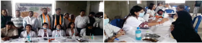
शिविर में लगभग 180 लोगों ने स्वास्थ्य लाभ लिया