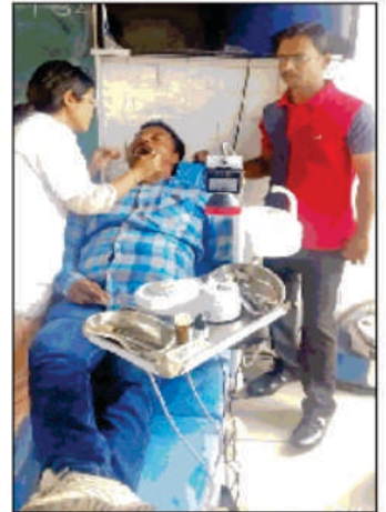
दांतों का उपचार करते हुए चिकित्सक।