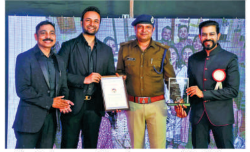
कॉलेज ऑफ डेंटल साइंस एंड हॉस्पिटल के सालाना उत्सव में खेल और ट्रेजर हंट

इंदौर। राऊ के कॉलेज ऑफ डेंटल साइंस एंड हॉस्पिटल का सालाना उत्सव इतिहासिक-2025 में बड़ संरचनात्मक कार्यक्रमों के साथ खेत प्रतियोगिता हुई। प्रिंसिपल ने युवा, गान, पेंटिंग, रागोली, टैगल हंट में हिस्सा लिया। डिप्टी प्रिंसिपल, कुटुंबीय, कैंपसिडन, टैगल टैगल, कैमरा के युवाओं द्वारा।